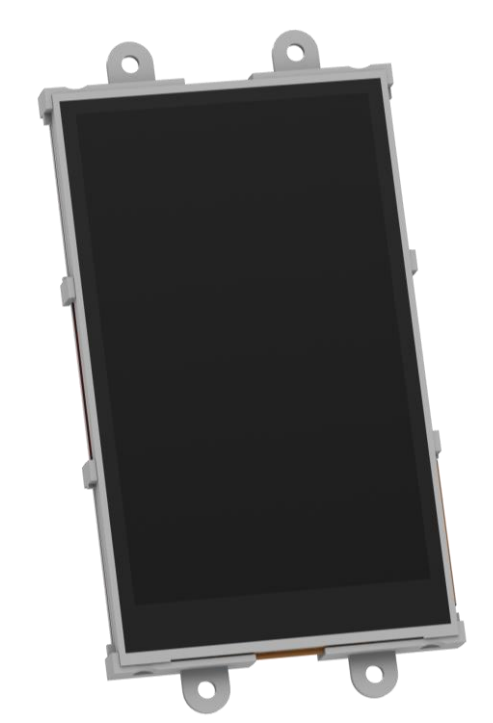
The uLCD-32W-PTU Display Module